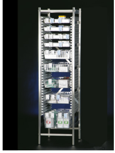
Classic 40/60 tray storage