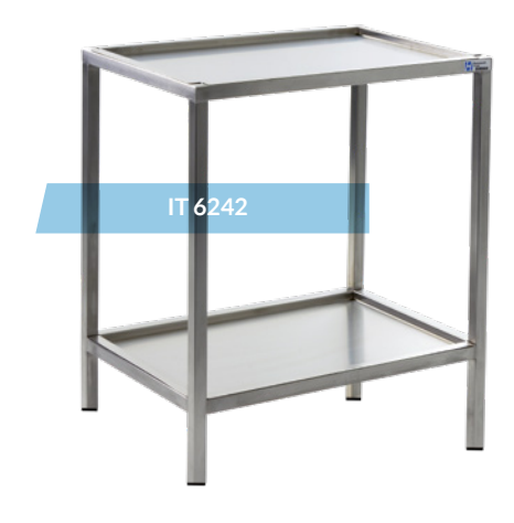
STATIONARY INSTRUMENT AND EQUIPMENT TABLE (MODELS IT AND GT)