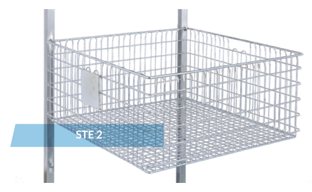
Labeling panel, approx. 103 \times 100 \text{ mm} (W x H) STE BF1