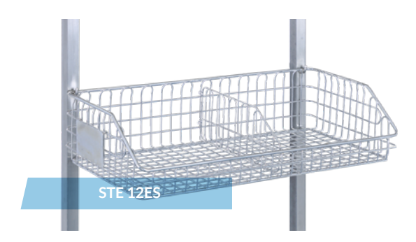
Labeling panel, approx. 100 \times 65 \text{ mm} (W \times H) STE BF12 Crosswise divider STE Q12ES