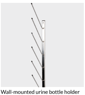
Wall-mounted urine bottle holde WUFH6