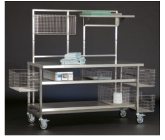
PTF7515 Packing table with accessories