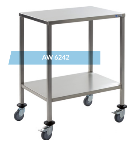
MULTI-PURPOSE TROLLEY (MODELS AW)