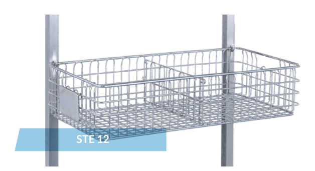
Labeling panel, approx. 100 \times 65 \text{ mm} (W \times H) STE BF12 Crosswise divider STE Q12