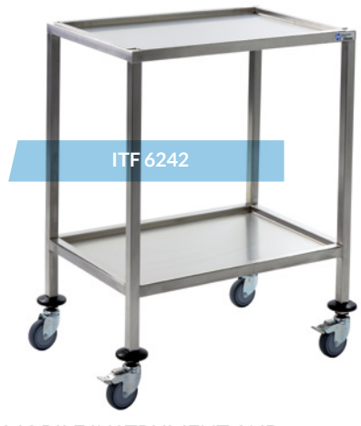
MOBILE INSTRUMENT AND EQUIPMENT TABLE BASED ON IT 6242 (MODELS ITF AND GTF)