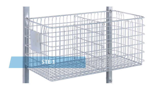
Labeling panel, approx. 103 \times 100 \text{ mm} (W x H) STE BF1 Crosswise divider STE Q1

Wire sizes: Upper frame 6.0 mm, wall frame 3.0 mm, loops 2.5 mm, base frame 5.0 mm