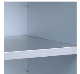
+ Shelves hygienic spaced mounted