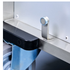
+ Magnet fixation of doors