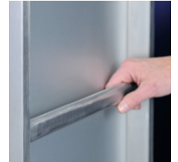
+ Ergonomic push handles on both face sides of the unit