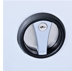
+ Doors with central lock, lockable