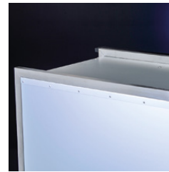
+ Stainless steel frame protects aluminum body