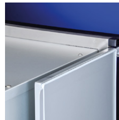
+ Rubber sealing around the door