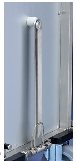
Joint and hitch KDRGAE

! Case carts with adjustable shelves on request. More accessories see page 106!