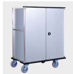
RGAE 250 closed

"Amazing Space! Our RGAE 250 excels in terms of its special depth!"