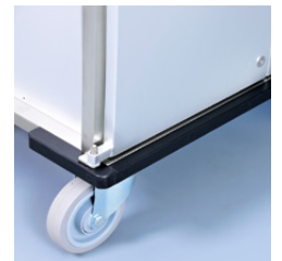
+ Stainless steel carriage with wrap-around polymer bumper (PE)