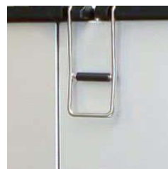
2-point locking system