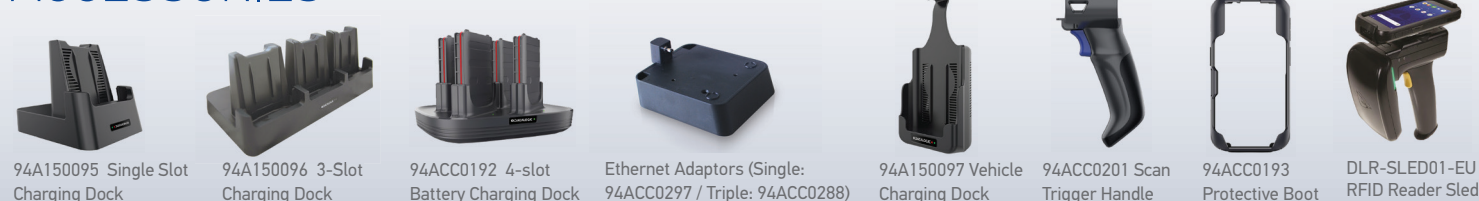
94A150095 Single Slot Charging Dock