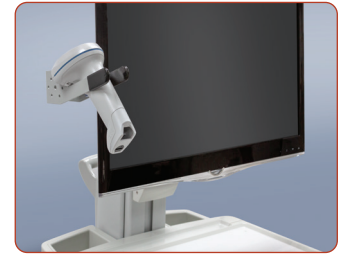
Forked Scanner Holder

Check with your Capsa Healthcare regional sales manager about these and more accessories specific to your chosen point-of-care solution.