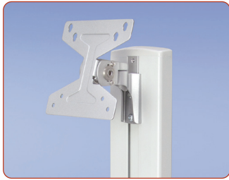
Height Adjustable Tilt Swivel Monitor Mount