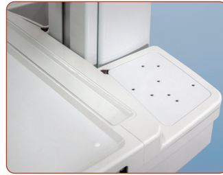
Pre-Drilled Rear Bin Scanner Plate