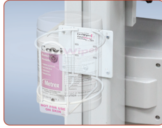
Sanitizing Wipes Bracket