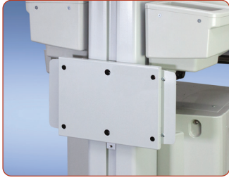
Sharps Bracket (Available for side mount)