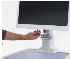
E. Connect monitor