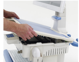
C. Remove work surface top