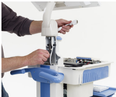
D. Route monitor cables through tech tray