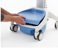
A. Remove cover