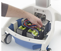
B. Connect batteries