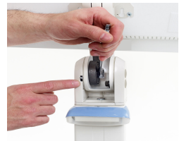
F. Adjust monitor tension, if needed (see Monitor Arm Adjustment in operator manual for details)