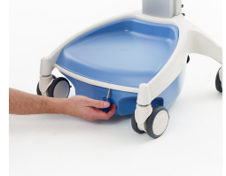
C. Replace cover and tighten screws