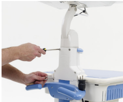
A. Loosen screws and remove union cover