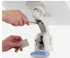
B. Loosen screws and remove monitor neck cover